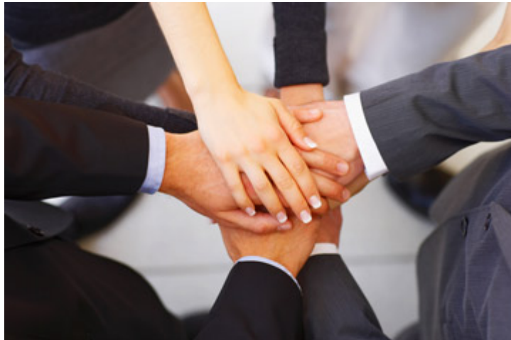
Figure 9 HRM as endemic to Learning and Teaching

If we consider education to be a learning organization, rather than a teaching organization only, then it is obvious that it needs to stimulate its workers and stimulate its mutual learning. The development of human resources has proved to be of impact on its corporate success. Policies need to be consolidated in documents that provide procedural guidance throughout careers.