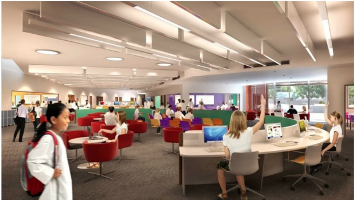
Figure 3 Classrooms Nowadays: Form follows Function

Learning needs design. In most of the cases we call it "Instruction". However a large part of the teacher task is the pedagogy to guide students to into the appropriate learning attitude and discipline.