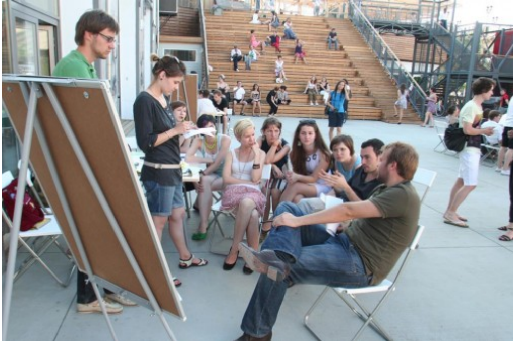
Figure 1 Educational Design on the Fly

This course is based upon the premise that the best anticipation to learning is the design by the teacher. The teacher's domain knowledge is crucial, however, it needs to be complemented by methods for conveying the learner from beginner to early expert. So far, teachers are experts in narration; talking to large groups of students on how to understand a certain topic. We see more and more that teachers need to use media, instruction, curricula and advanced testing methods, in order to cope with a lack of time and a higher competition.