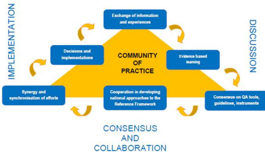
Figure 5 Community of Practice for the learning among Teachers

Communities of Practice (CoP) are the best model for sharing skills and experiences among teachers. Media like video conferencing allow teachers to contribute to colleagues' lessons remotely. The critical factor is the sense for lateral problem solving as defined by De Bono, 1970. The research into analyzing collaborative learning by argumentation can be found in the work on Visualizing Argumentation by Kirschner et al. (2003). The goal of this course is to provide teachers with the first principles of speech genres; Bakhtin, 1986.