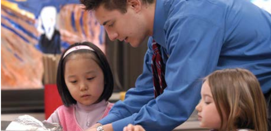
Figure 2 How can we Teachers support Students' Learning?

Education is not only talking about technology: it also needs technologies like mobile-, virtual- and ubiquitous presence. Media are famous for its broadcasting effects: the radio, the TV, the telephone and now the large portals like Wikipedia and the searchable web. Newspapers face the challenge to survive among free information sources. 'Serious' gaming and simulations offer the suggestion that learning only flourishes if the player has the full mindset to concentrate on concepts that have been recognized by curriculum-and test designers before.