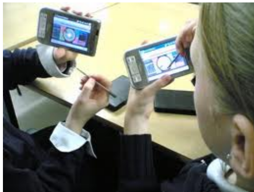
Figure 7 Mobile Learning for Stationary Applications

Mobile devices like smartphones, PDAs and tablets allow learners and teachers to access the web and online “Apps” (Applets) at various stages of the learning. When the continuous connectivity reaches a point of omni-presence (ubiquity), one may imagine that there is no difference between sitting behind the screen of a desk- or laptop or walking in the street of before the blackboard. Once the visual, auditive, haptic and kinematic senses get more realistic and immersive we may call this fictional “presence” as “virtual reality”. Ultimately there will be no difference between physically “being” in a real- and being in a virtual environment. What does it mean for real schools in five years from now?