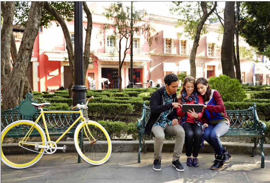
Learning can happen anywhere.

Going beyond common social media tools, Yammer from Microsoft provides enterprise-level social networking that encourages discussion and collaboration throughout the institution by enabling everyone in the domain to post comments and engage in open dialog. Students and educators can confer, debate, and share, and others can contribute or promote their ideas. Because Yammer provides asynchronous communication (unlike instant messaging, which is synchronous), Yammer provides an opportunity for students to reflect, craft their thoughts, and then respond to each other.