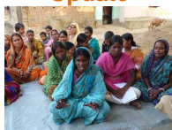
Interacting with the women of Darpashila Village near Shantiniketan, West Bengal, India

In November 2010, a team from Boston University's Women's Studies Program and the Bhab Initiative visited and wrote on one of the original Srihaswani (Creative Manual Skills for Self-Reliant Development) villages near Shantiniketan, West Bengal, India. This