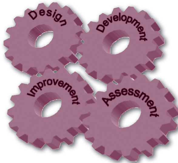
Figure 1. Stages for policy development

The following four stages for policy development are recommended for the successful integration of accessible ICTs in an educational environment. These include the design and development of the accessible ICTs, their implementation and improvement and the assessment of their benefits (Fig. 1).